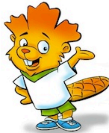
1) a Maple-leaf headed beaver