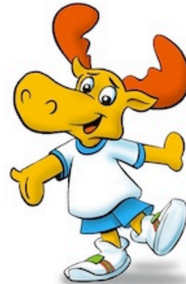
2) a moose