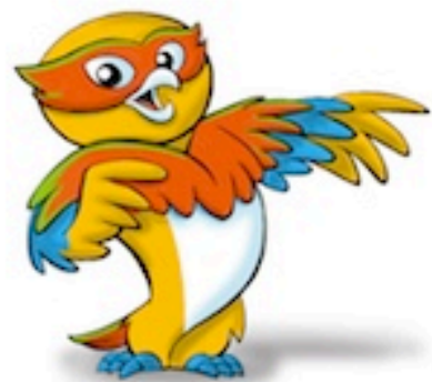
3) a multi-colour owl