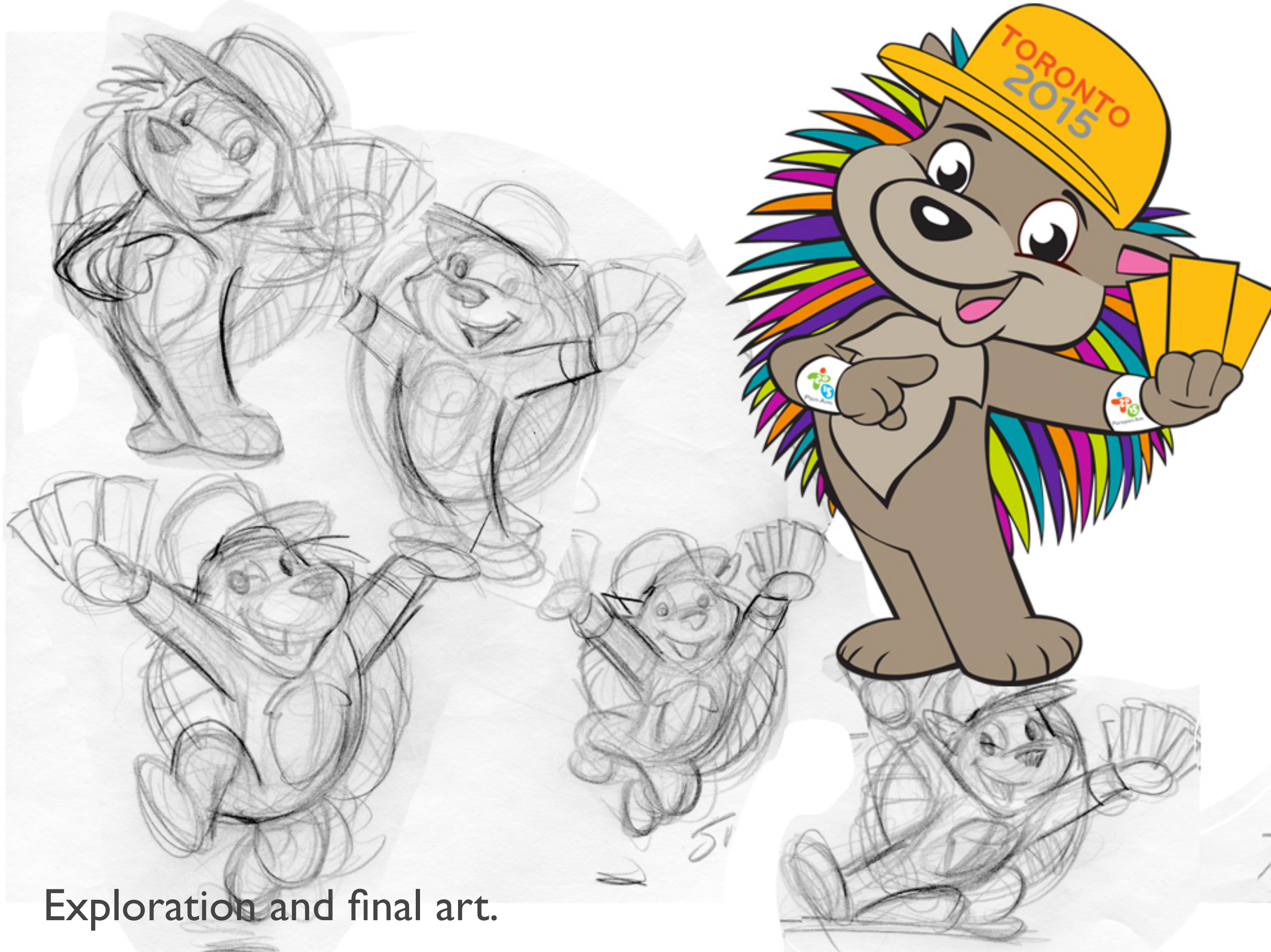
Exploration and final art.