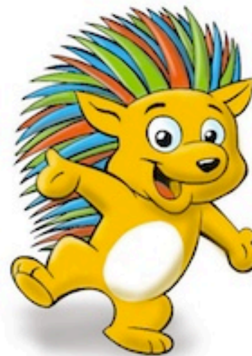
4) a porcupine with multi-color quills