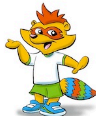
5) a raccoon